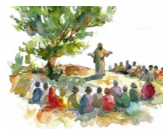
Jesus preaches the Sermon on the Mount

The Sixth Sunday of —Year C- February 16th 2025